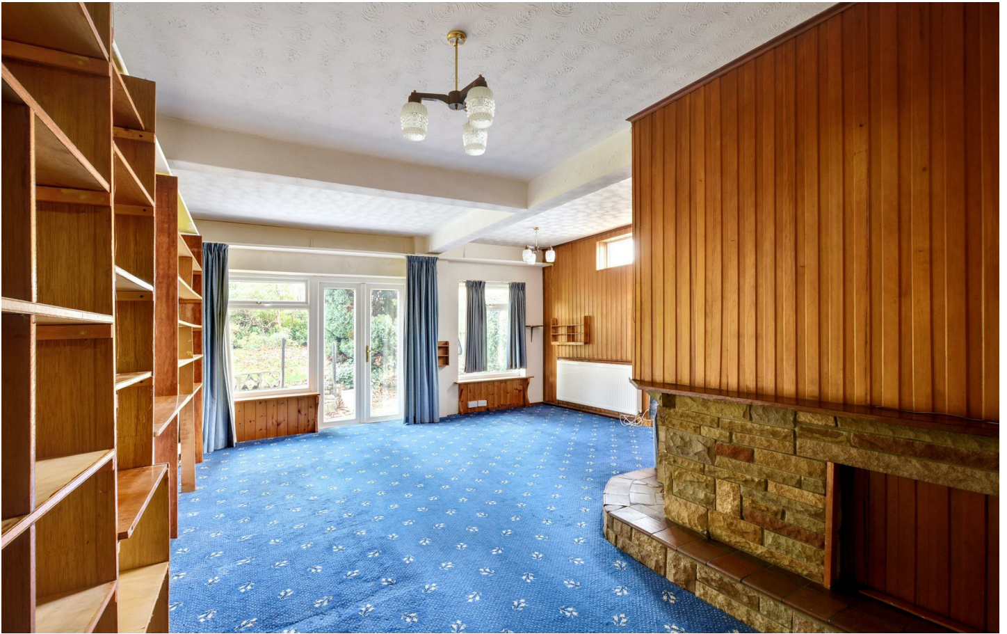
A deceptive and versatile four-bedroom chalet style house offering great potential.

Requiring renovation and updating, this property is an excellent opportunity for the incoming purchaser to update and remodel to their taste and requirements and is offered to the market with the benefit of chain free vacant possession.